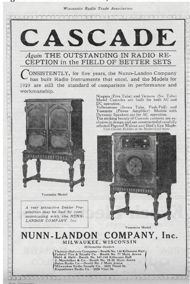
Figure 6 - Nunn-Landon Ad, October 1928

In the WRTA Broadcaster in October 1928 Nunn-Landon advertised (see Figure 6) a group of sets under the Cascade name, 1929 models including the Niagara (5 tube) and Victoria (6 tube) for DC or AC operation, and the Yellowstone (7 tube) AC model and the Yosemite console AC console shown in the ad. The ad lists seven dealers for Nunn-Landon sets, including Flanner-Hafsoos Co., Federal Tire and Supply Co., Held and Held, J. Mandelker & Co., Bates Radio Co., Milwaukee Radio Supply Co., and Kappelman Radio Co.