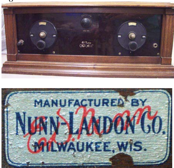
Figure 3 – Nunn-Landon 1926 Cascade

In 1927 Nunn-Landon produced the elaborate battery powered console Cascade model V-27, shown in Figure 4, complete with matching piano stool. Figure 5 shows the similar table model