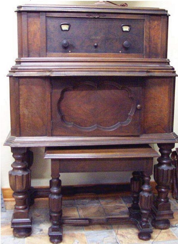
Figure 4 - Nunn-Landon Model V-27 Cascade Console, 1927