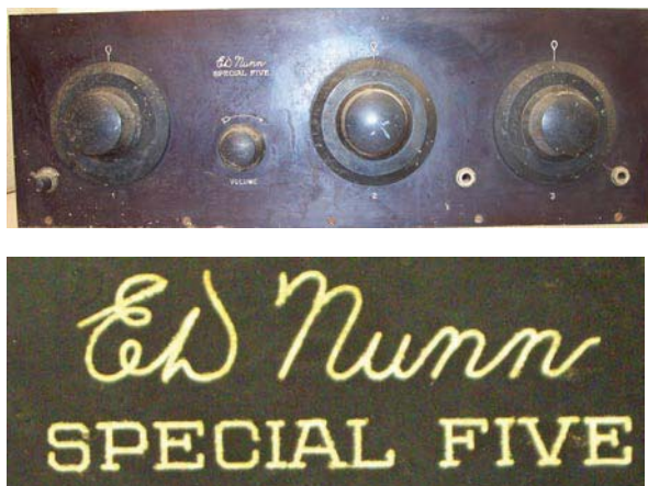
Figure 1 – ED Nunn Special 5

Others are labeled ED Nunn but also have a Nunn-Landon tag, and Figure 2 is an example of such a set, the model N4A. It also bears a label saying it was distributed by the Hansen Storage Company of Milwaukee, and probably dates from 1925.