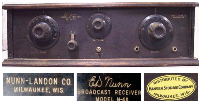
Figure 2 – Nunn Model N4A

marked ED Nunn on the front panel but also has a Nunn-Landon sticker.